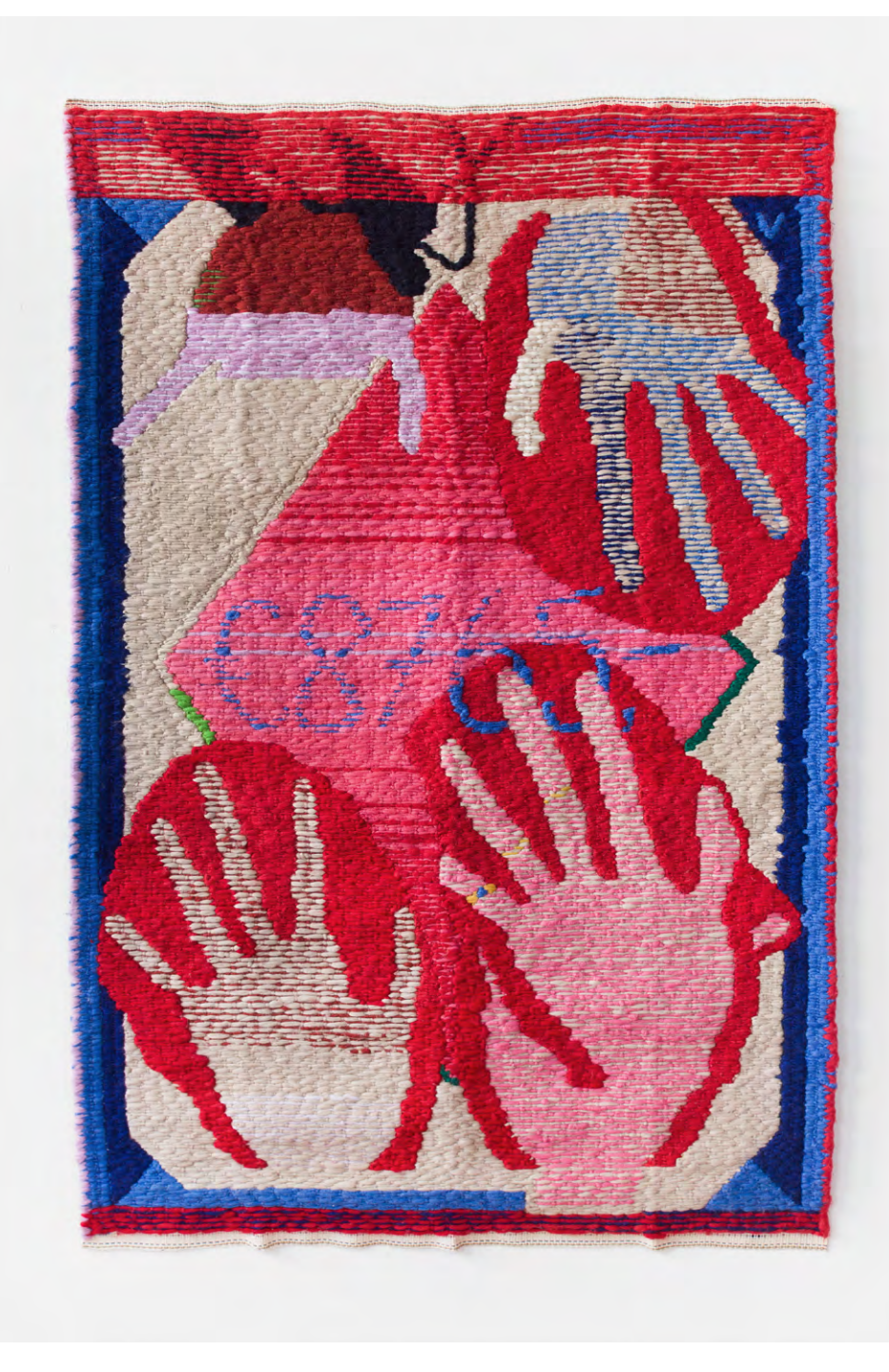
Excluding VAT, 2019, 100 x 150 cm, wool embroidered on a cotton grid