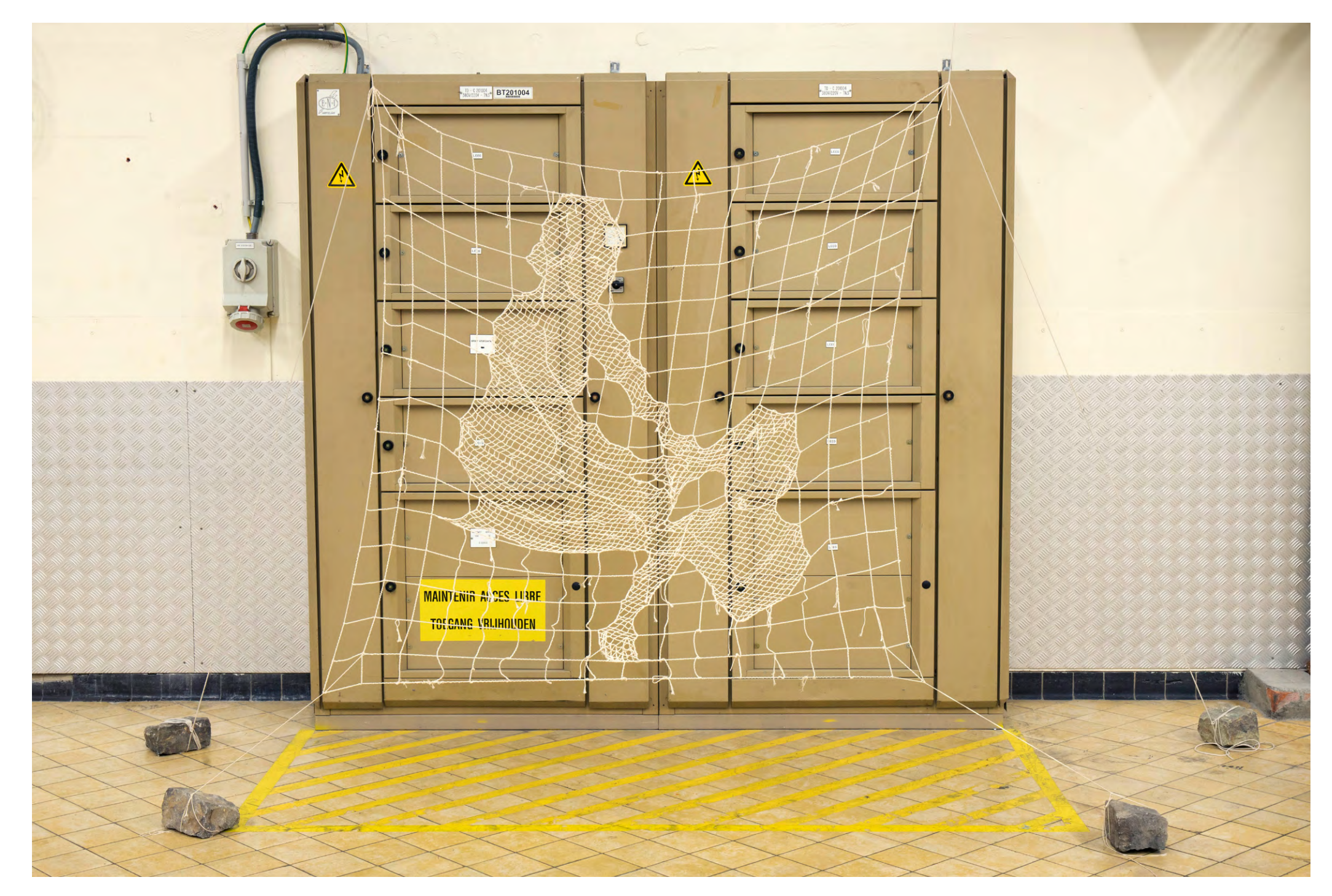
Mnemosyne and Lethe at work, 2022, 160 x 160, cotton cord, installation photo by Anaïs Chabeur, Generation Brussels during Brussels Gallery Weekend