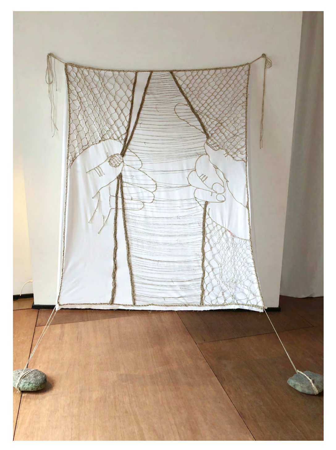
Untitled, 2021, 152 x 188 cm, linen cord on cotton, stones, installation photo, 10N Brussels