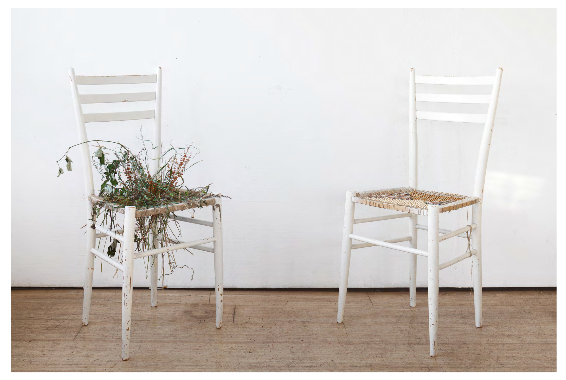
Peter's Breath on a Starlit Tennis Court in Valensole, 2021, 93 x 36 x 80 cm, grandparents' chairs, linen cord, copper wire, weeds, wooden, stone, glass and pearl beads