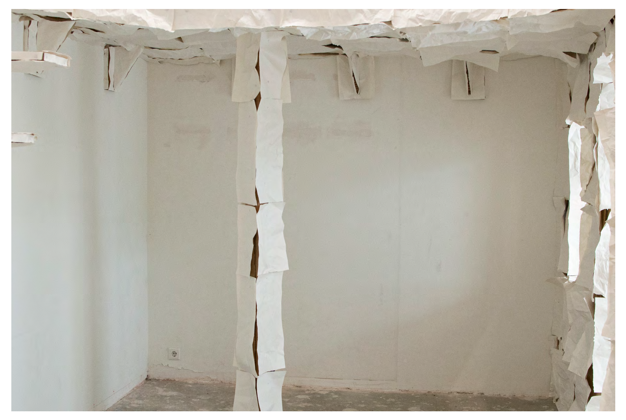
Dress rehersal, 2023, an installation of cardboard, drawing paper, drawing pins, glue and tape.